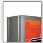
Double Sided Only 5" Deep