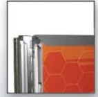
Easy Access For Graphic Placement