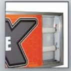
Single Sided Only 3 1/2" Deep